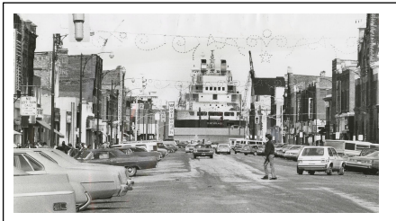
Ship construction at the Top of Hurontario St.