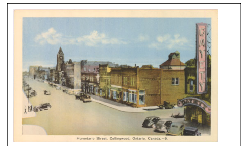
East side of Hurontario St. between 2 nd & 3 rd Streets