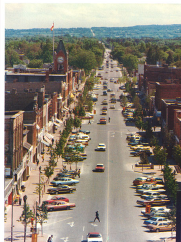
Hurontario St. Looking South